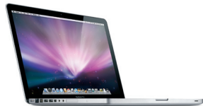
MacBook Pro 15.4"